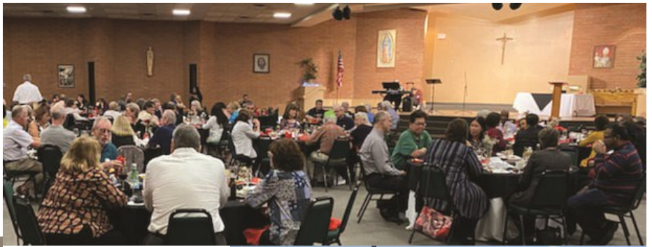
Volunteer Appreciation St. Vincent de Paul Donation Trucks

The goal of discipleship is to become like Jesus himself: to think as he thought, to feel as he felt, to act as he acted, to desire what he desired.