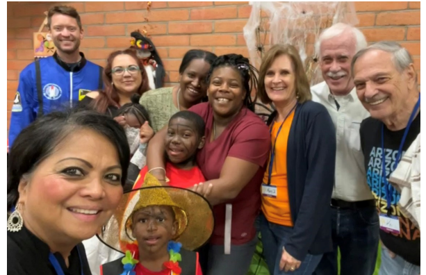
Housing the Homeless with Family Promise