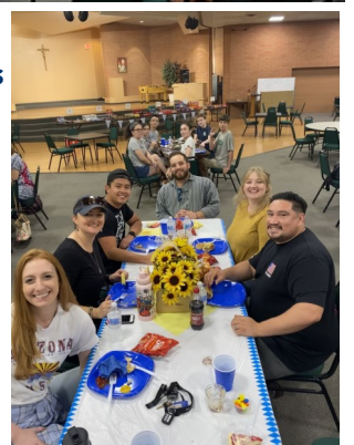
Parish Game Night