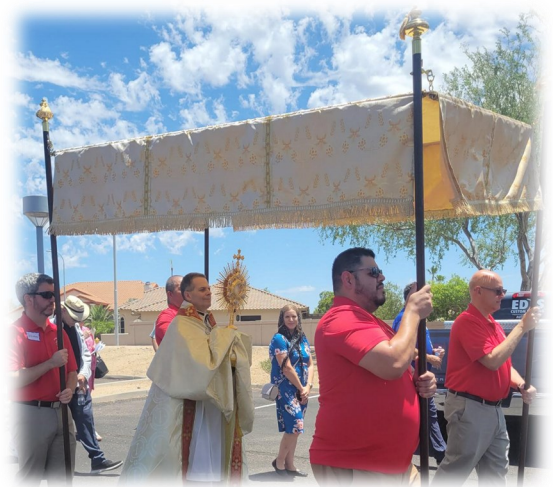
Corpus Christi Feast Day Eucharistic Procession June 19, 2022