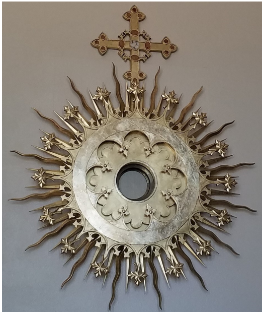
Perpetual Eucharistic Adoration Easter Baskets for Frank Elementary Kids