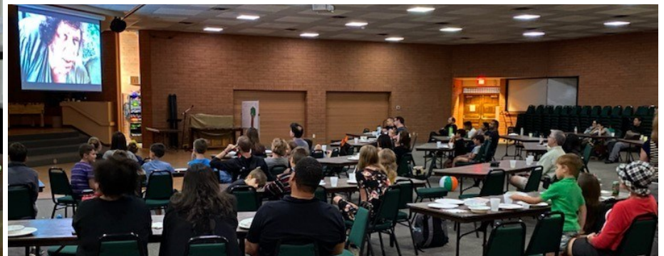
Family Movie Night: The Princess Bride